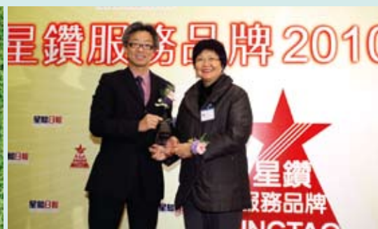
Sing Tao Excellent Services Brand Awards 2010 星鑽服務品牌選舉2010