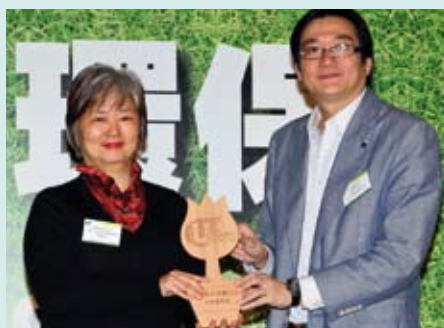
U Green Award 『您』想綠色生活選舉