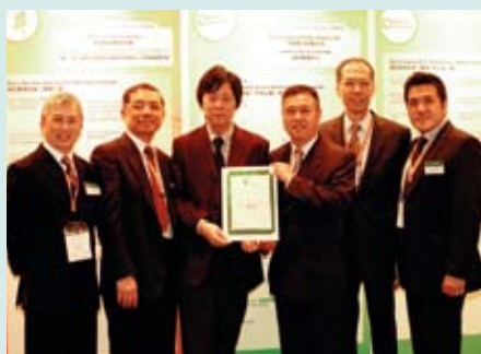
Hong Kong ICT Awards 2011 香港資訊及通訊科技獎2011