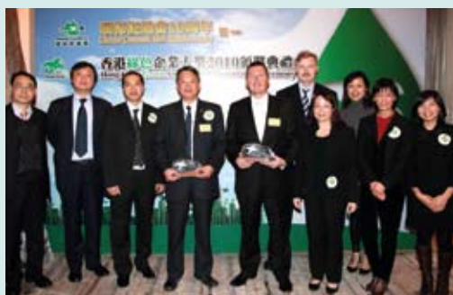
Hong Kong Green Awards 2010 香港綠色企業大獎 2010