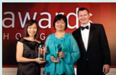
Hong Kong HRM Awards 2010 香港人力資源獎 2010