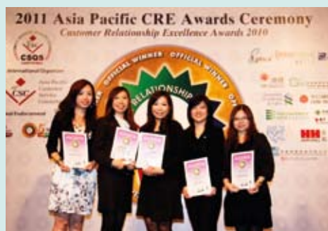
APCSC Customer Relationship Excellence Awards 亞太傑出顧客關係服務獎