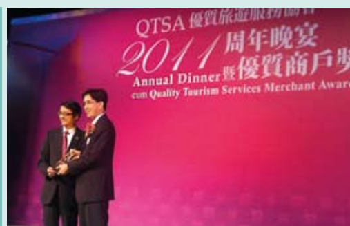
2011 Outstanding QTS Merchant Award – Merit Award (Restaurant Category) 「優質旅遊服務」計劃2011傑出優質商戶 — 優異獎(食肆類別)