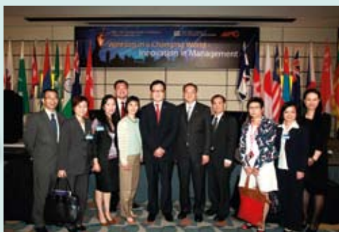
Award for Excellence in Training and Development 2010 2010年最佳管理培訓與發展獎