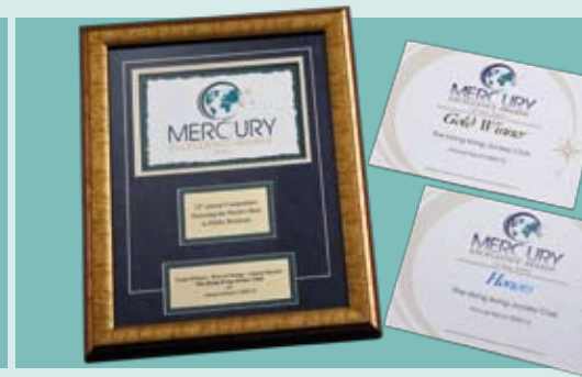
Mercury Excellence Awards 2010/11 2010/11年度 Mercury 企業傳訊大獎