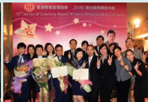
2010 Service and Courtesy Awards 2010 傑出服務獎