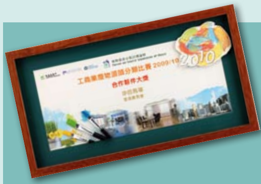
Award for Co-operative Partnership under “Source Separation of Commercial & Industrial Waste Programme” 「工商業廢物源頭分類計劃」合作夥伴大獎