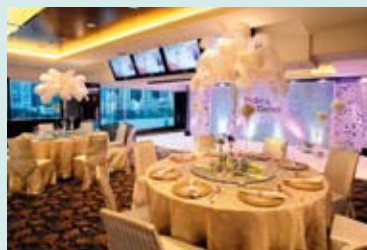
Bridal Awards 2010 – Best Club Wedding Banquet 新婚生活易大賞2010 — 「新人至愛會所婚宴大賞」