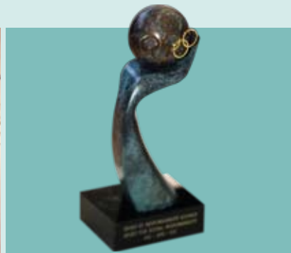
2011 IOC Trophy – “Sport and Social Responsibility” 2011年度國際奧委會「體育與社會責任」大獎