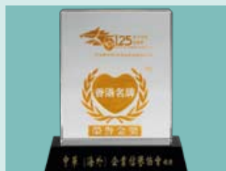
2010 Most Favourable Hong Kong Brands – Hall of Fame Gold Award 2010年度全國消費者最喜愛香港名牌——「永久殿堂級香港名牌金獎品牌」