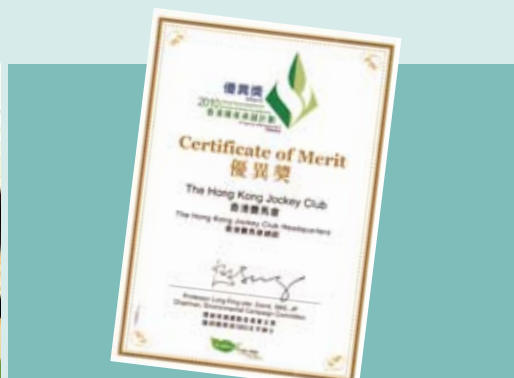
HKAEE Sectoral Award 2010 – Property Management Certificate of Merit 2010香港環保卓越計劃界別卓越獎 — 物業管理優異獎