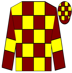
BOOM THE GROOM