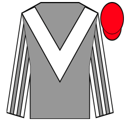
DUKE OF FIRENZE