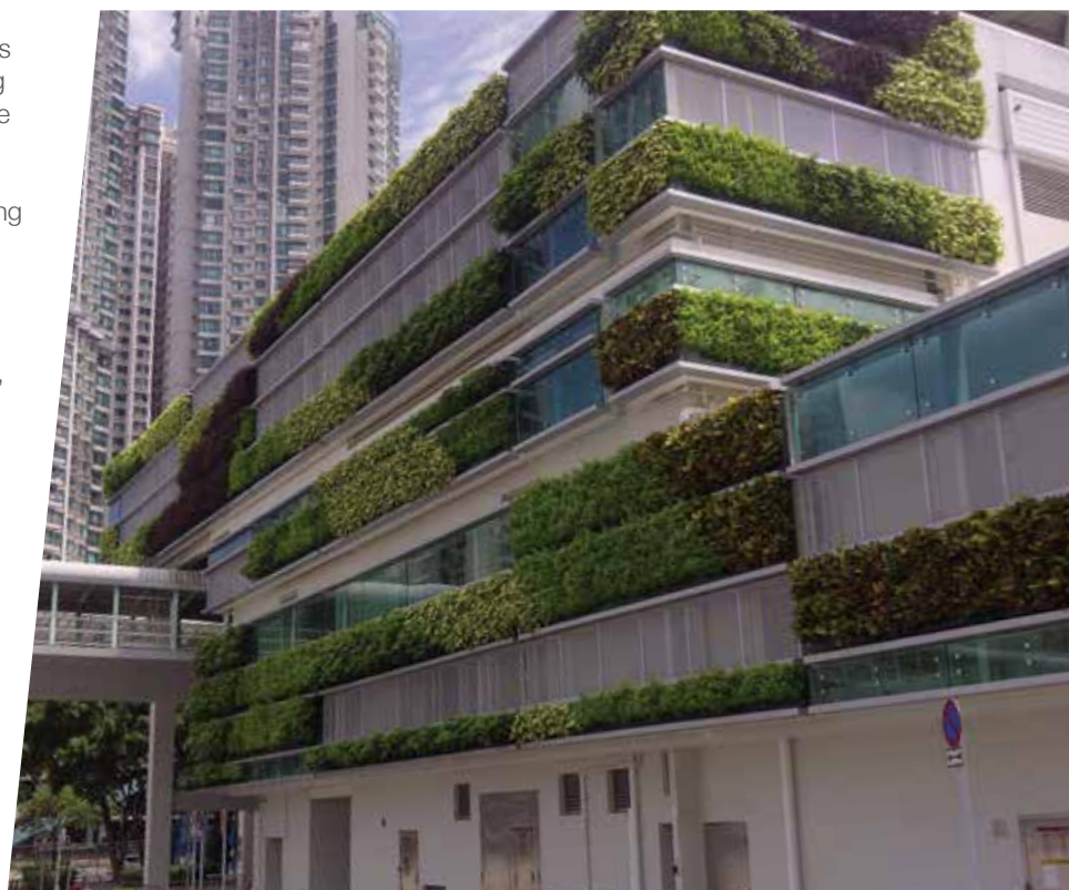
The New Energy Centre at Sha Tin Racecourse houses energy-efficient water-cooled air-conditioning systems.

此外，自二〇〇八年以來，馬會便陸續為一百零二間場外投注處、辦公大樓及其他設施改裝更節能的照明設備及製冷系統，其中包括沙田馬場的馬房設施。改善工程範圍包括室外指示標誌及照明系統、停車場、電梯大堂、洗手間，以及其他顧客和員工設施。截至目前，馬會單就改裝照明系統的工程已投入逾一千三百八十萬港元，每年節省耗電量約四百萬千瓦時。