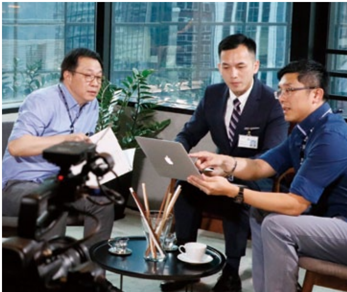
Police officers filming a public education programme to promote responsible gambling.

The Club is making every effort to tackle and raise awareness of illegal gambling. It chairs the Asian Racing Federation's Anti-Illegal Betting Task Force, established in 2017, and regularly collaborates with local and international law enforcement agencies. But clearly this is a problem which requires concerted action not only across borders but within Hong Kong itself.