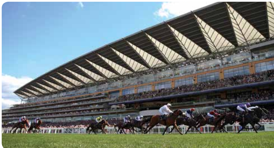
The Ascot World Pool on Britain's Royal Ascot was the first time the Club has offered commingling on an overseas race meeting. 馬會為英國皇家雅士谷賽期開辦「雅士谷全球匯合彩池」，是馬會首個為海外賽馬日開設的匯合彩池。

馬會下季的匯合彩池合作夥伴將增至超過40個，遍佈14個國家及地區，新合作夥伴來自丹麥、挪威及格林納達。