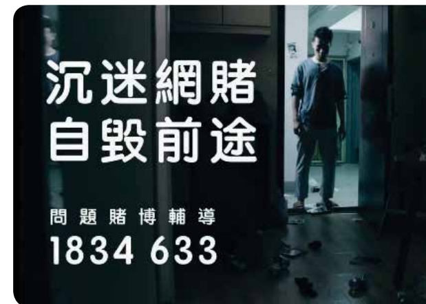
(above and left) The Club supports public information campaigns warning of the dangers and consequences of illegal gambling. (上及左圖)馬會支持各類宣傳和公眾教育工作，提醒市民非法賭博的禍害。

馬會不遺餘力打擊非法賭博，提醒市民相關禍害，並一直支持警方及與國際執法機關合作。亞洲賽馬聯盟轄下的打擊非法賭博專責小組，就是由馬會高層擔任主席。監管機構、執法機構、體育機構及金融機構必須攜手合作，透過跨境聯合行動和香港境內執法，方能有效打擊非法賭博，保障市民大眾。