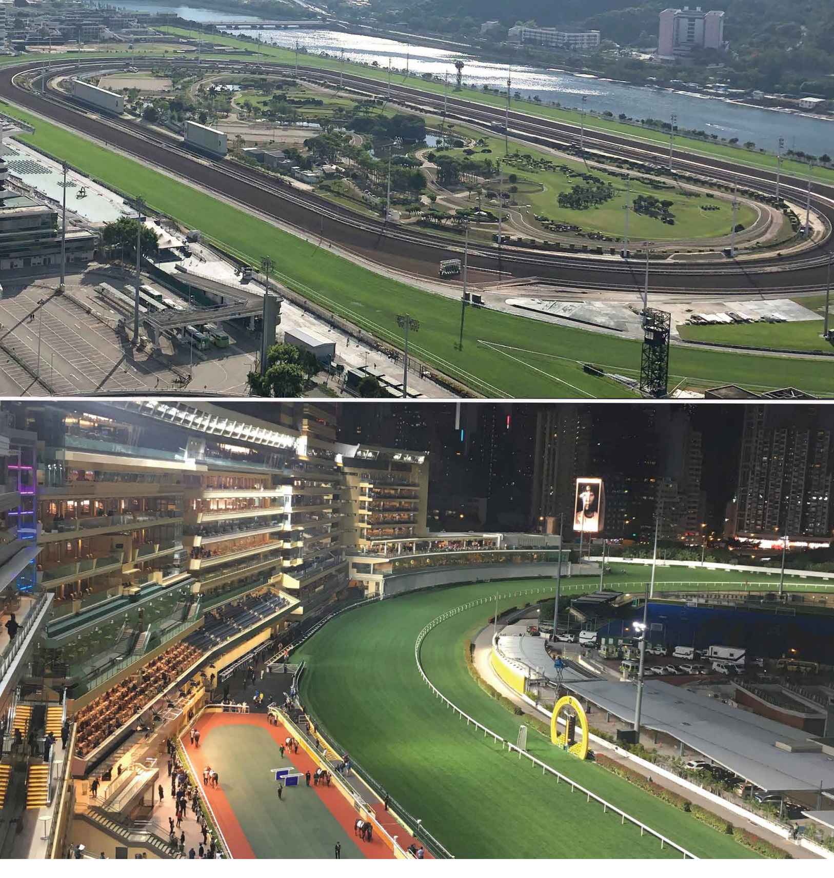
Copyright © 2021 The Hong Kong Jockey Club. All rights reserved.

The materials are copyrighted and must not be used, reproduced or distributed without prior written consent of The Hong Kong Jockey Club ("HKJC"). The materials are provided on an "as is" basis for information purposes only. None of the HKJC, its affiliates or any person involved in or related to the compilation of the materials (collectively the "HKJC Parties") makes any express or implied warranties or representations with respect to the accuracy, timeliness or completeness of the information or as to the results that may be obtained by the use thereof. In no event shall any HKJC Parties have any liability of any kind to any person or entity arising from or related to any action taken or not taken in respect of such information.