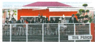
The Perch located in the iconic Birdcage

If it's views of the racetrack you're looking for, then corporate facilities like Trackside offer spectacular views within touching distance of the horses.