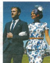
Celebrating racing fashion and colour

There is no more widely viewed cultural and sporting event in Australia and its incredible ability to capture the hearts and minds of a nation is something very special.