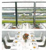
The Rose Room's incredible views