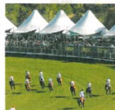
Trackside private facilities overlooking the track.

No other event endears itself to such a wide diversity of people from here and abroad. It's a once in a lifetime experience for many guests and quite simply, it's the invitation everyone looks forward to and never forgets.