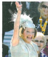
Gal Waterhouse 2013 Melbourne Cup winning trainer

There really is an abundance of hospitality choices at this year's Melbourne Cup Carnival to ensure your guests leave Flemington with an amazing experience permanently etched into their minds. An experience that will leave them waiting with eager anticipation for next year's invitation.