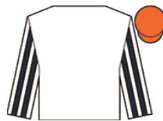
LINE OF REASON