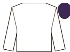
SIGN OF THE KODIAC