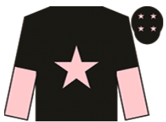
MOVE IN TIME