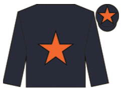
EXCEED THE LIMIT