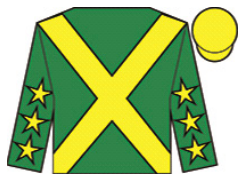
BOOM THE GROOM