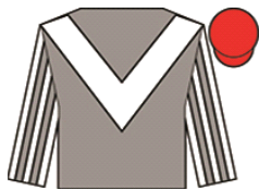
DUKE OF FIRENZE