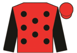
THE GRAPE ESCAPE