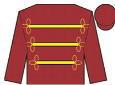
SON OF THE STARS