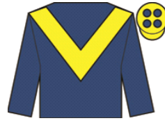
CITY OF JOY