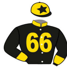
NIGHT OF ENGLAND