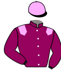
RED THE WEST