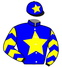
SAMAGACE DU VIVIEN