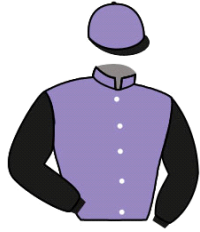
GOOD TO TALK