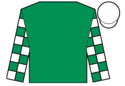
LEO DE FURY