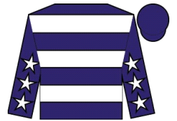
OH THIS IS US