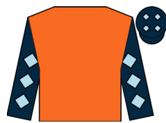
CLIFFS OF CAPRI