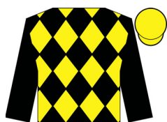
OO DE LALLY