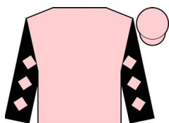
FOOLS RUSH IN