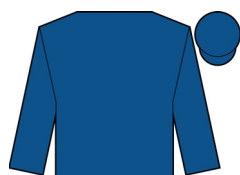
PATH OF THUNDER