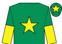
STAR OF ORION