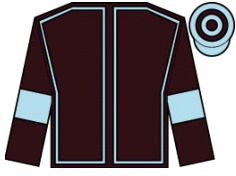
ARENAS DEL TIEMPO