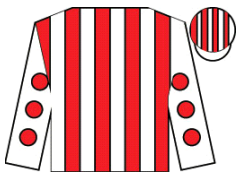
PRINCE OF BEL LIR