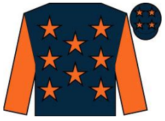
AMOR VINCIT OMNIA