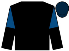
SANDS OF MARRA