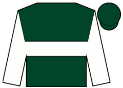
ROCK N ROLL ROCKET