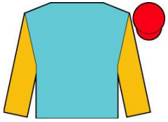
CHANGE FOR GOOD