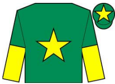
STAR OF ORION