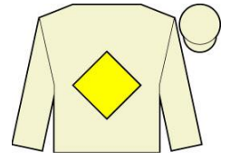
CATCH THE PADDY